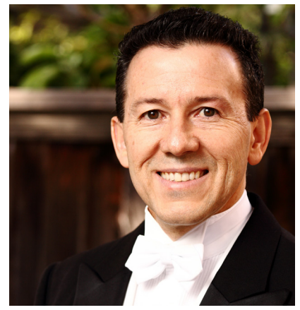
ALEJANDRO GUTIÉRREZ conductor

This is a ticketed event for the covered seating area. Free tickets are available (4 per person over age 16 while they last) at the Miller Outdoor Theatre box office the day of the performance between the hours of 10:30am-1pm. If tickets remain at 1pm, the box office will re-open one hour before the concert time to distribute the remaining tickets. As always, there is open seating on the hill.