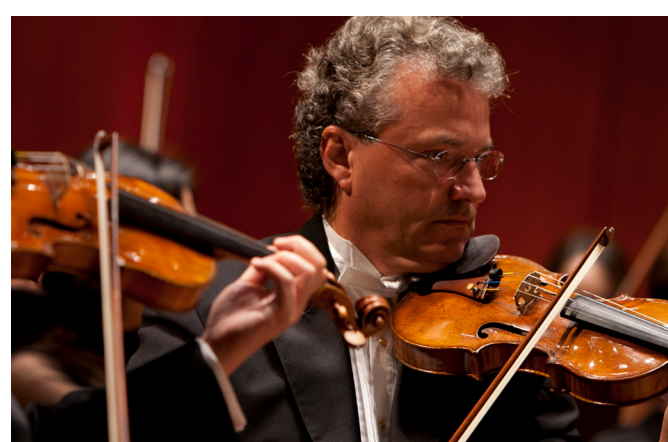
FEATURING THE HOUSTON SYMPHONY